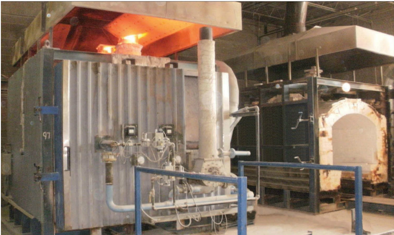
Sunrock Ceramics produces high-purity alumina refractories, including specialty shapes such as kiln furniture for technical ceramics manufacturers.

Sunrock Ceramics is the winner of the 2015 CI Supplier of the Year Award!